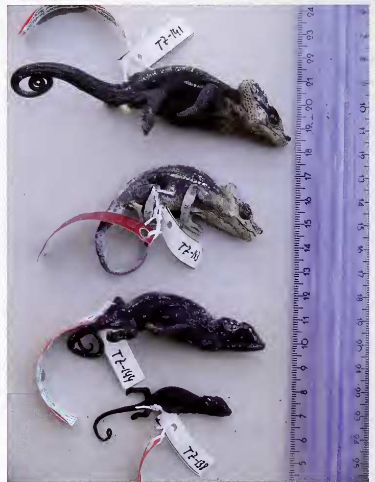
Fig. 2. Type material of K. u. artytor ssp. n..

All measurements and investigated morphological characters of the specimens are listed in Tables 1–3. The morphological traits which differentiate the male specimens of Mt. Hanang from those of the South Pare Mountains and Ngorongoro crater highlands are: higher measurements, a relatively broader and shorter head, rougher (more convex) scalation on the head and body, canthus parietalis (cp) not bi-forked anteriorly but fan-shaped anteriorly and the cp composed of two rows of scales (Fig.